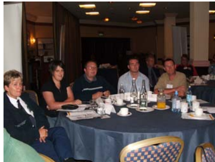
Recovered from the night before