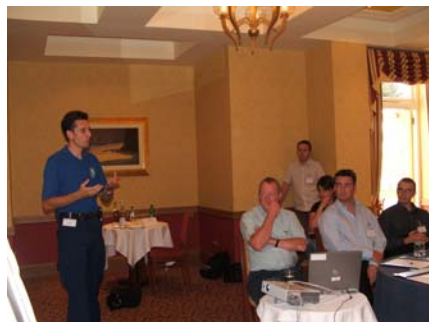
Robin trying to make a point