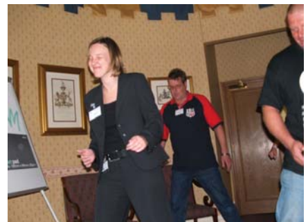
Wasn't all hard work

I would just like to say a big thank you for the invitation down to Torquay to your regional conference, having only worked for the Eastern Warden Resource Centre since April I felt it was very informative on how warden schemes in different regions vary due to their geographical location and diversity of their communities. Also it was an ideal opportunity for the resource centres that did attend to share good practice. So thank you again and keep up the good work!