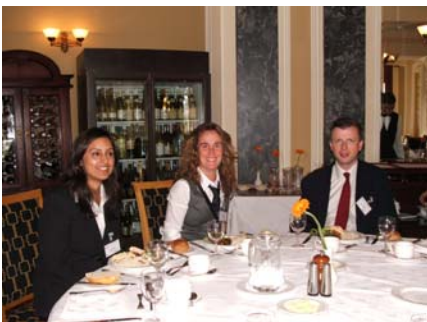
Our colleagues from other resource centres