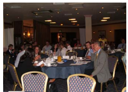
Partial view of Conference in action