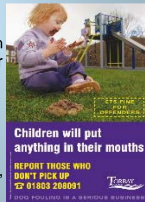
A poster from the winning campaign

For those that win a Keep Britain Tidy Award it is a high profile and visible way of demonstrating to the public, staff, stakeholders and customers that not only are you taking environmental responsibilities seriously but that you are leading the way in this area.