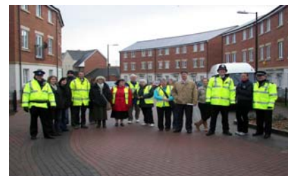
The Upper Horfield Neighbourhood Team

The Pride of Place Action Group, which has been working hard to get the award, is led by Bristol Community Housing Foundation (BCHF) and involves local resident Street Reps, the Police, Safer Bristol, Bristol City Council and recycling company Sita. It was set up eighteen months ago to maintain the quality of the local area and help residents who have issues with their waste and recycling.