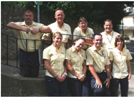
The Torbay Warden Team