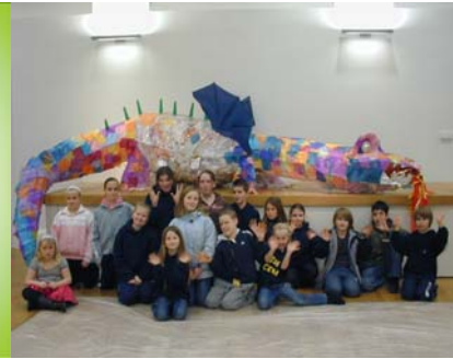
The Litter Dragon